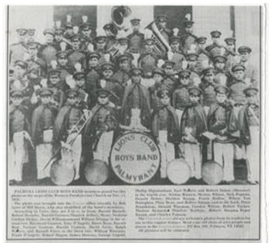
The Palmyra Lion Boy's Band from the late 1890's