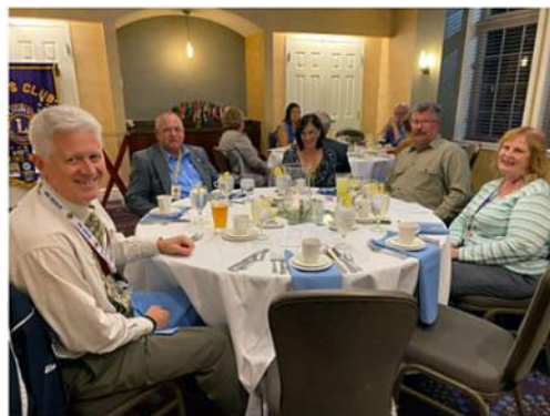
Lions Meeting and dinner